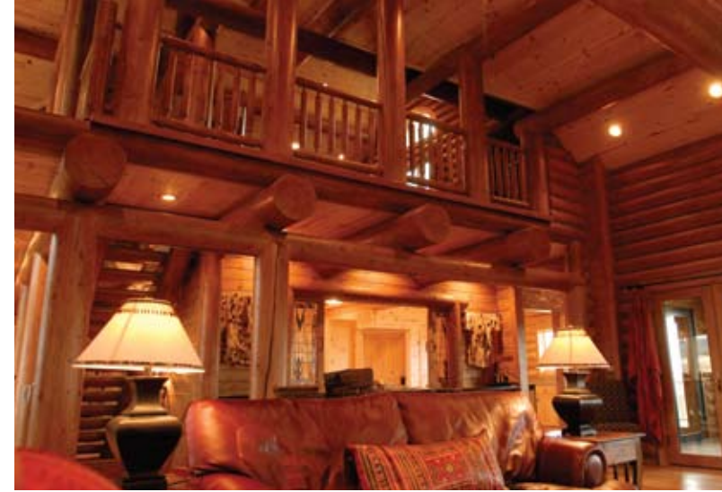
Glazed timbers set against natural pine ceilings provide dynamic detailing.