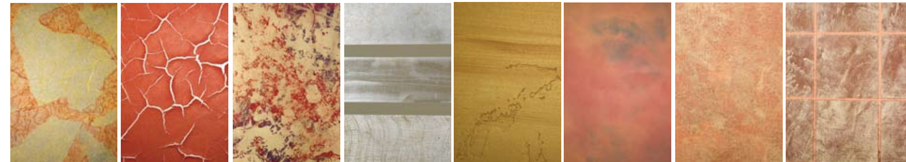
From left to right, decorative finishes: Two-layer tissue; Cracked LusterStone™; Pull-off relief O'villa® plaster; Pearl Palette Deco™; Glaze over gold metallic set-coat; Embellished fresco plaster; Multi-layered Fauxtex; O'villa® tiles over Sandstone