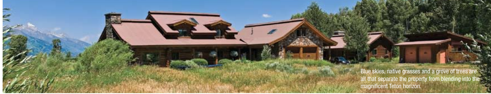
Blue skies, native grasses and a grove of trees are all that separate the property from blending into the magnificent Teton horizon.