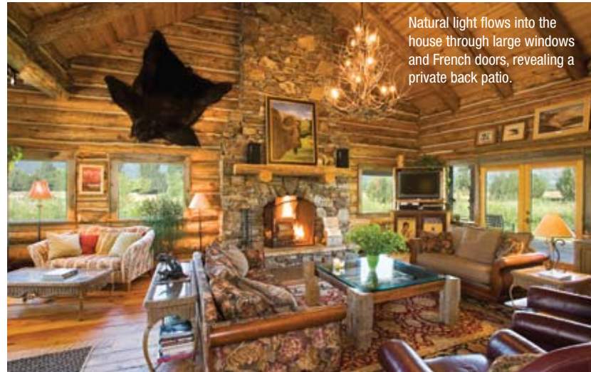
Natural light flows into the house through large windows and French doors, revealing a private back patio.