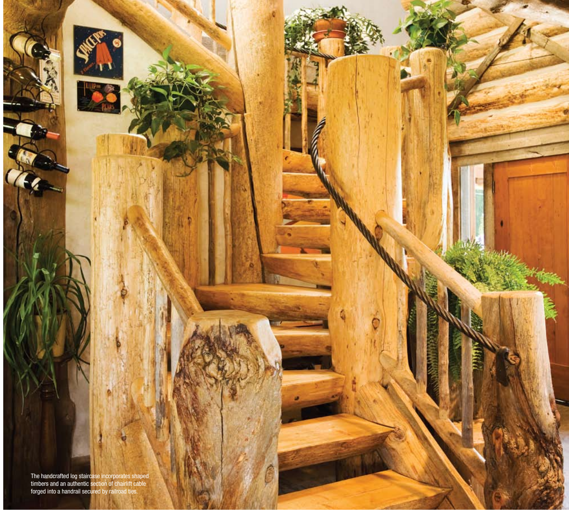
The handcrafted log staircase incorporates shaped timbers and an authentic section of chairlift cable forged into a handrail secured by railroad ties.